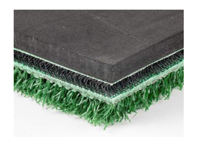
153D 15mm nylon knitted crimp + 10mm elastic fibre + 10mm EVA foam