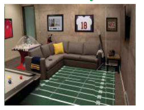
6.3 Printed Nylon Turf