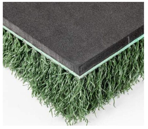
T4010B- TEE UP MATS 40mm tee line turf + 10mm EVA foam

We increase the weight of mat to avoid sliping.